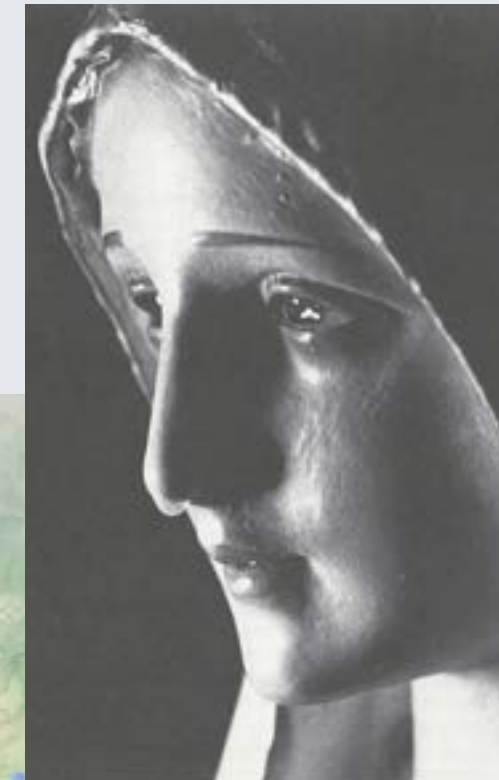
The Weeping Madonna