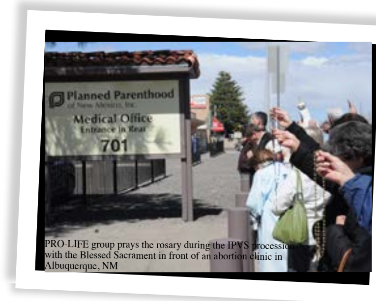
PRO-LIFE group prays the rosary during the IPVS procession with the Blessed Sacrament in front of an abortion clinic in Albuquerque, NM

Will you "Have pity on the Heart of Your Most Holy Mother that is covered with thorns which ungrateful men pierce Her (Heart) without anyone making an Act of Reparation to remove them?." ■