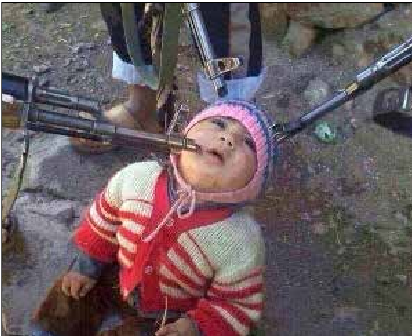
"A child photographed waiting to be killed by militants. ISIS uses these images to terrorize others. It is reported via CNN that children's heads are being erected on poles in a city park. WE CAN prevent these slaughters through our rosaries, reparation and sacrifices. When are we going to say, "Enough, is Enough."