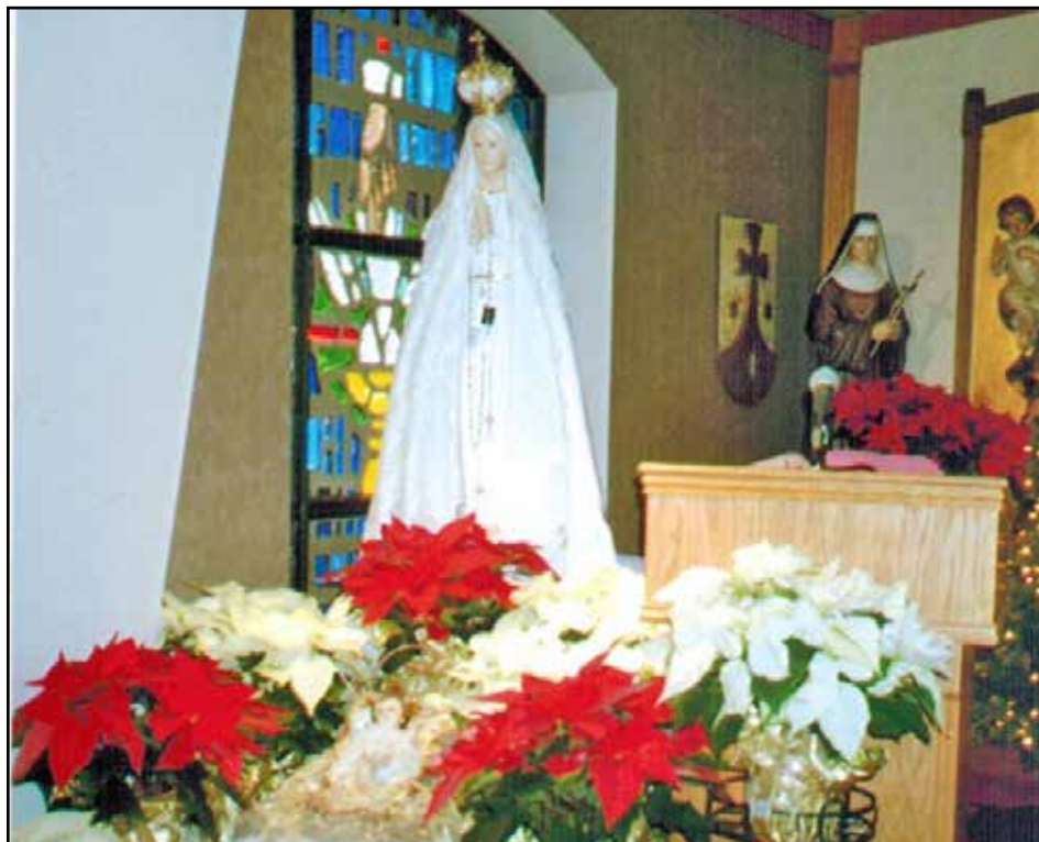
St. Joseph Carmelite Home - East Chicago, IN

The graces we gain for the conversion of sinners by our Lenten offerings are limited only by our efforts . Yes, if all Christian people would do enough during Lent, ISIS may be ended by their conversion. But, to make up for our own too often half-hearted response, and lack of effort by many others, we must go through the year offering reparation for sins, so that sinners may be converted. Continuing to offer our daily rosary and our daily share of crosses throughout the year, in reparation for sins, will bring from God the conversion of many sinners and a better world for all of us.