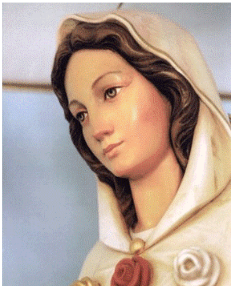
Our Blessed Mother as the Mystical Rose

On the morning of December 8th, people began arriving at the little church at 8:00 a.m. from neighboring towns. By noon, some 10,000 people had gathered to see the Blessed Mother, many of who had to stand outside because the church did not have enough room for the large crowd.