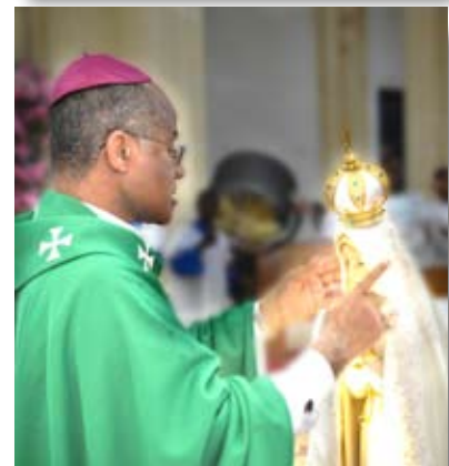
Archbishop Miot is seen here crowning the International Pilgrim Statue inside Port-au-Prince cathedral. He died in his office during the earthquake when the cathedral collapsed.